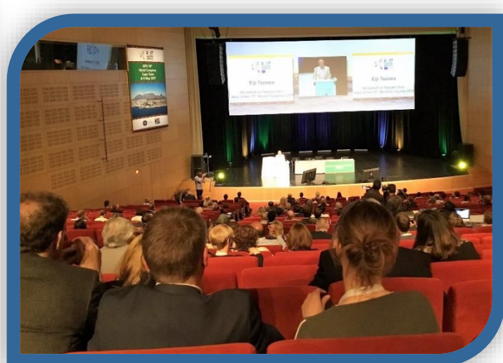
The main auditorium