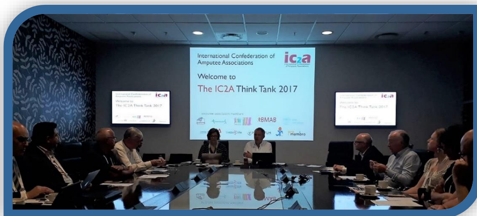
The 2017 IC2A Think Tank meeting